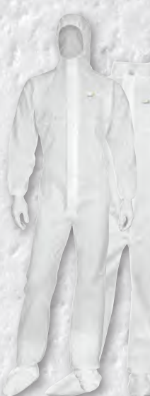
DT215 / DT215CV